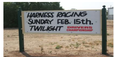
Sign 2: Located at Dimboola Road