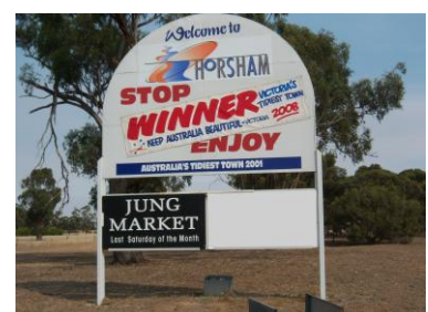
Sign located at Western Highway near Caravan Park